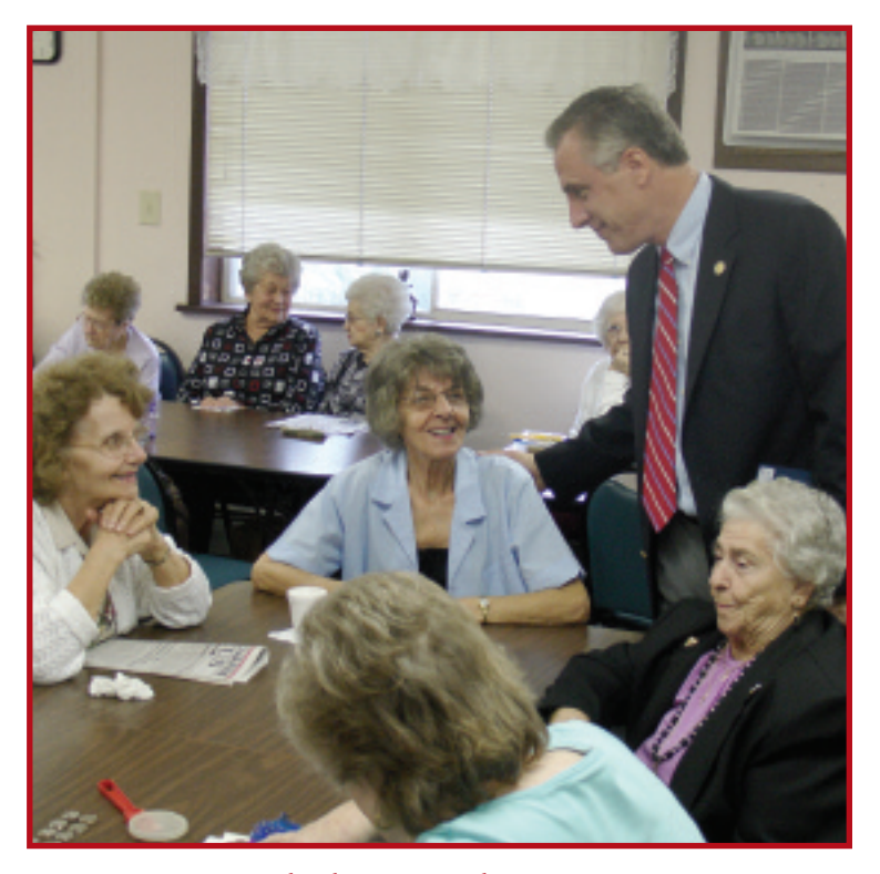
Congressman Murphy discusses Medicare's new prescription drug plan at a local seniors' center.

Call 1-800-MEDICARE, or PACE/PACENET at 1-800-225-7223